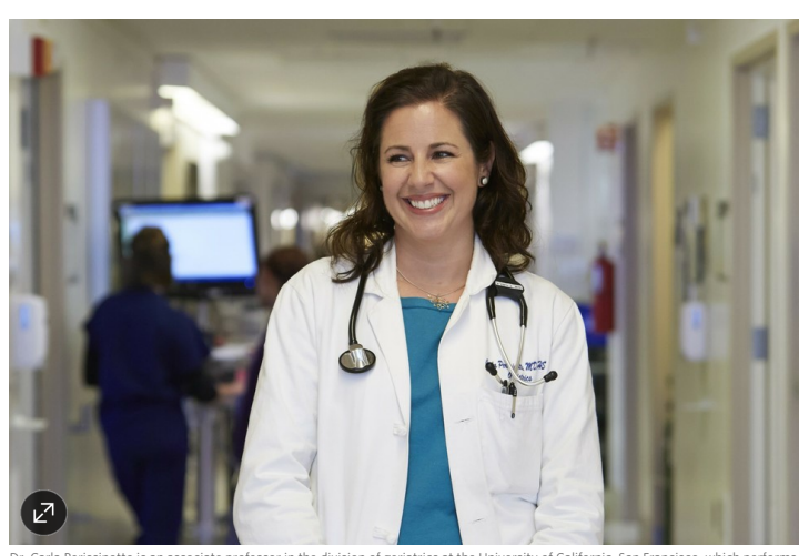
an associate professor in the division of geriatrics at the University of California, San Francisco, which perfo of all heart-failure patients as part of a formal evaluation before surgery.

Cognitive evaluation can help doctors anticipate potential postoperative risks